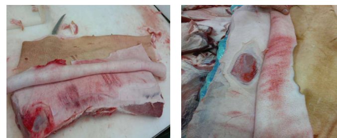
Badly bruised loin due to incorrect slap marking & poor handling

Since Rosderra launched its carcase and pig quality recording system information has been gathered on over 1 million pigs which have been slaughtered. Rosderra currently has the facilities to monitor levels of bruising at arrival to our lairage, cleanliness of animals, numbers of casualty pigs received, milk spot/pleurisy levels carcase quality and lean meat percentage for each supplier. This information will then be used as part of the procurement process with suppliers and will identify where potential gains can be achieved by suppliers by reducing pig quality issues. Rosderra's target for the future is to improve efficiency and product quality by addressing these issues at farm level.